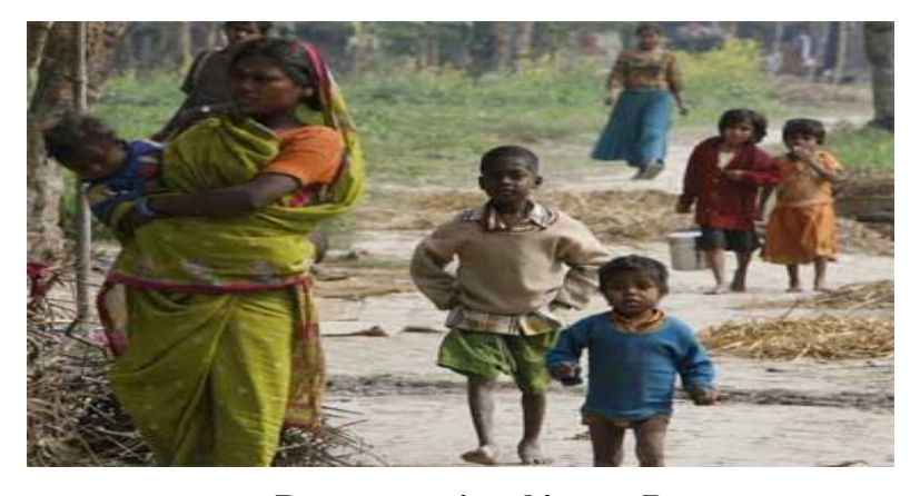
Representational image

India continued to rank low in the Human Development Index (HDI), climbing just one notch to the 130th rank in the latest UNDP report on account of rise in life expectancy and per capita income. India ranked 130 among 188 countries in Human Development Report 2015 released on Monday by the United Nations Development Programme.